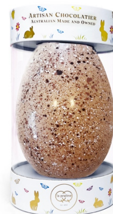
CRÈME CARAMEL Caramelised white chocolate, a perfect balance of sweet and rich indulgence.