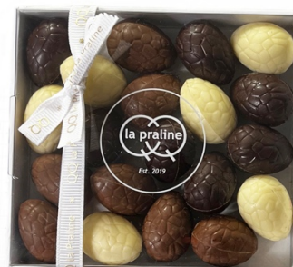
LET'S GO NUTS Pistachio Hazelnut and Almond Praline