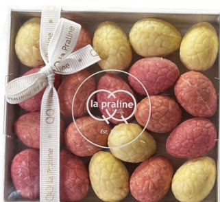
TUTTI FRUTTI Strawberry, Raspberry, Passionfruit