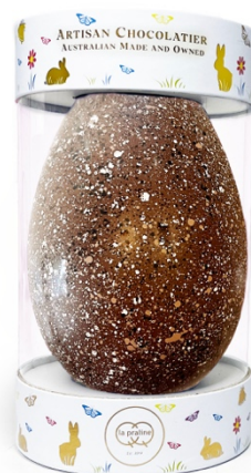
HAZELNUT AND FEUILLETINE Milk chocolate with crunchy feuilletine and hazelnut, offering a delightful blend of smooth, crispy, and nutty textures.