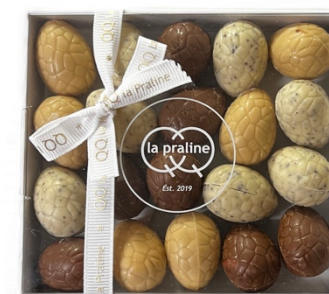
CAFÉ CRÈME Coffee white, Coffee milk, Crème caramel