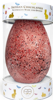
RASPBERRY White chocolate blended with raspberries, offering a delightful fusion of fruity and tart flavours.